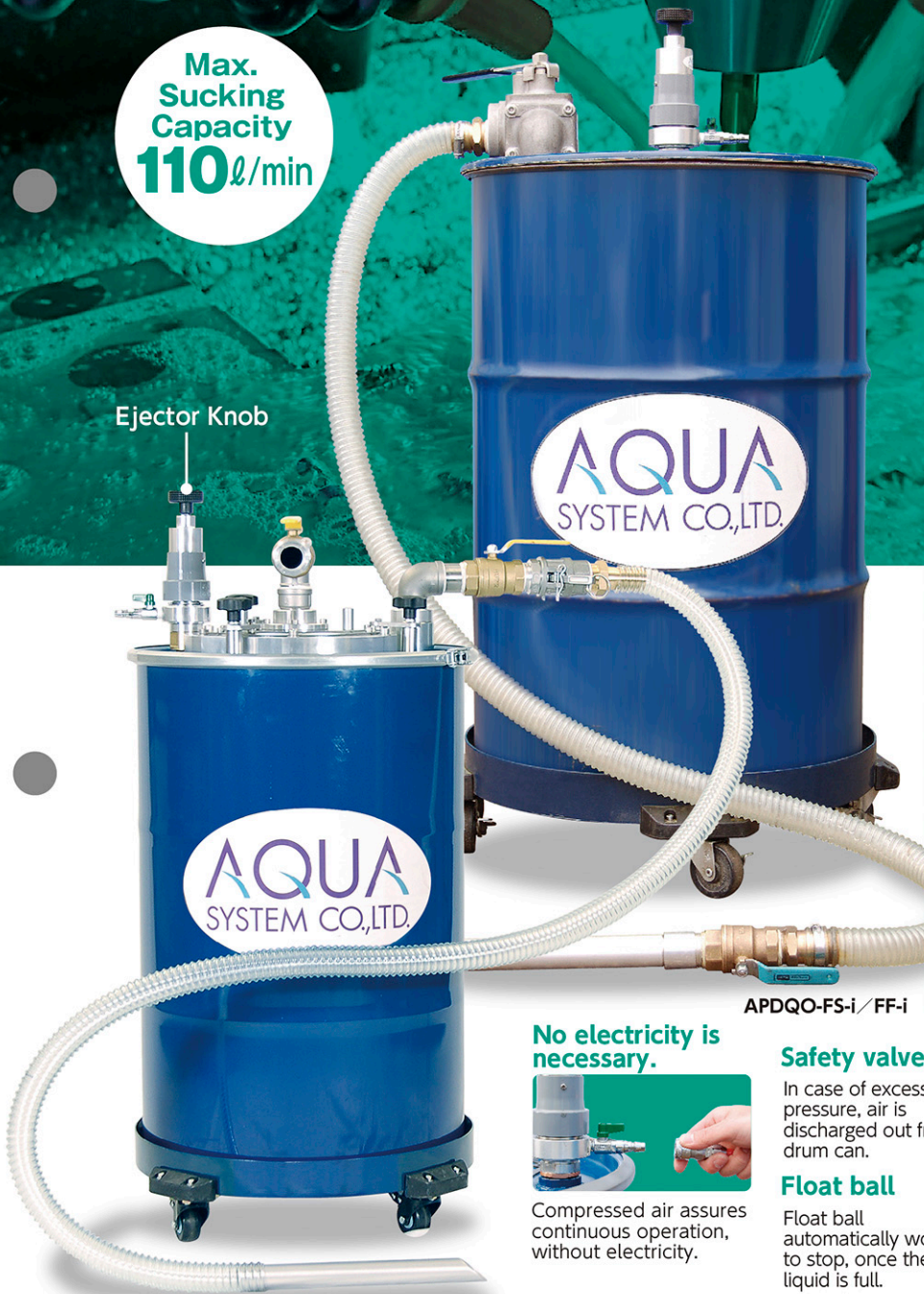
APDQO-FS100-i / FF100-i