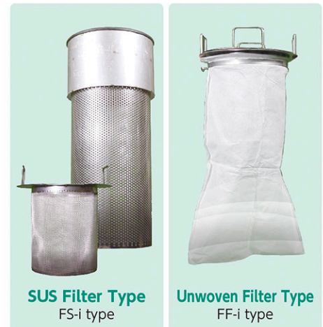
SUS Filter Type FS-i type