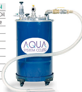
APDQO-FS100-i / FF100-i