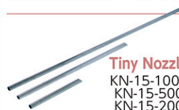
Tiny Nozzle KN-15-1000 KN-15-500 KN-15-200