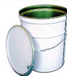
Open Pail Can APPQO-OP